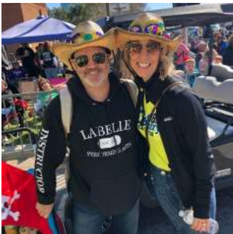
Our LPA directors representing at the Pensacola Mardi Gras Parade