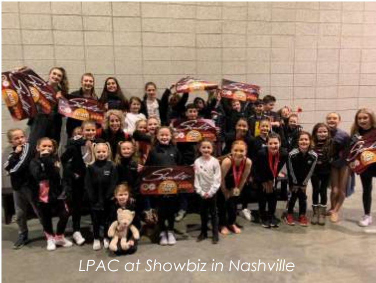
LPAC at Showbiz in Nashville